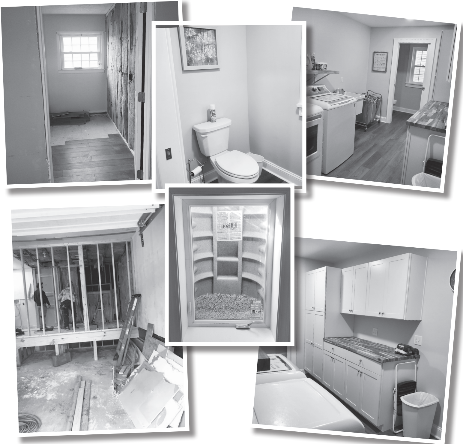
Expanded Laundry Room, Half Bath & Fire Exit Remodel.