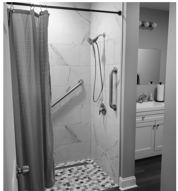
West Wing Resident Suite Remodel